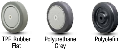
TPR Rubber Flat