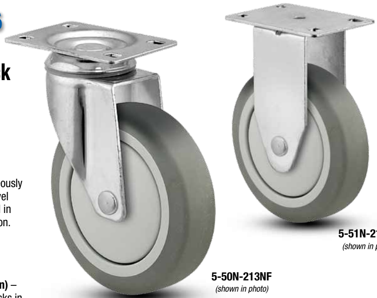
5-51N-213NF (shown in photo)